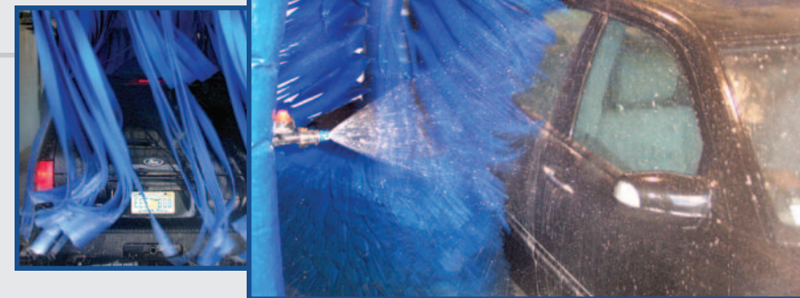
All Belanger components are built to withstand rigorous use day in and day out.

The Pro Class 100™ features an operator programmable controller, giving you the ability to control wash packages seasonally and to adjust for high or low volume days. In addition, the system gives you the versatility