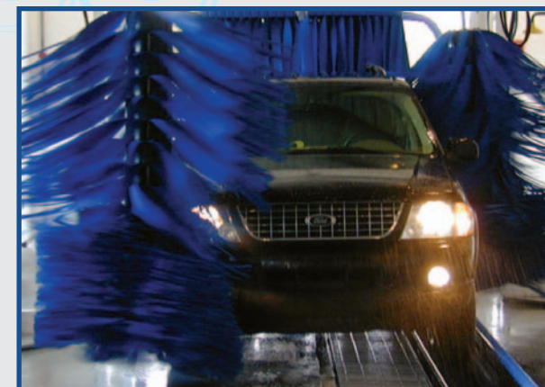
Bright colors and soft lines offer an inviting look and help optimize the customer experience.