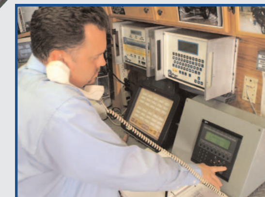
At Belanger we incorporate state-of-the-art technology into every piece of equipment we manufacture.

With approximately 100 patents to our name, our mission is to design, manufacture, sell and service vehicle wash systems that make our customers' lives easier and their businesses more profitable. We invest in research and development initiatives every year. When you buy Belanger products, you buy the company behind the name, too.